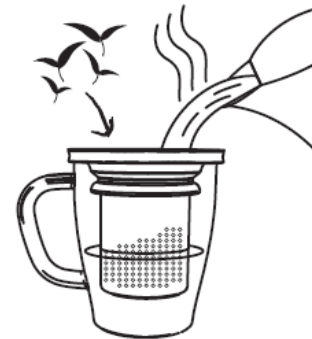
1 Add loose tea leaf and hot water