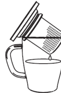
3 Sieve the tea by special infuser design