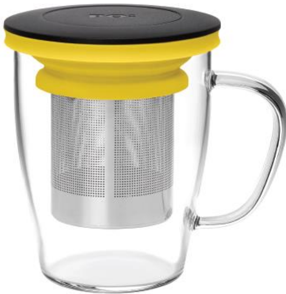
MING INFUSER GLASS MUG www.po-selected.com