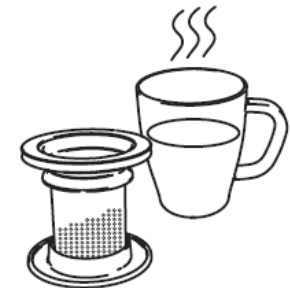
4 Rest the infuser on the upturned lid design