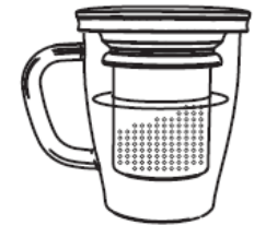
2 Start tea brewing